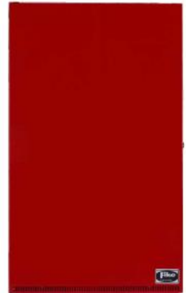
Three Amp Enclosure