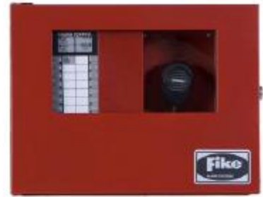
Local Operating Console