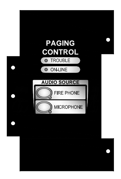
Exhibit 1: Paging Control Card

UL S3217 FM Pending CSFM Planned MEA Planned City of Denver Planned