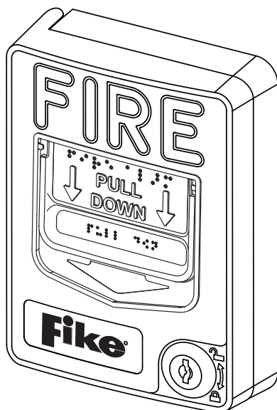
FIGURE 1. ADDRESSABLE MANUAL PULL STATION (SINGLE-ACTION)

Rotary dial switches are provided for setting the pull station's address. (See Figure 3.)