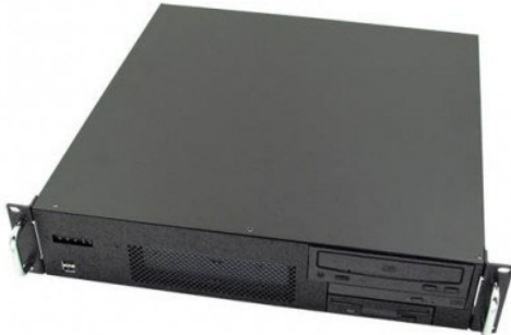
12 and 18 TB NVR