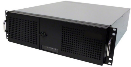
12 and 18 TB Server

Multiple Network Servers can be installed and accessed over a single IP network by one VMS workstation for easy scalability. This provides the ability to build an enterprise-level surveillance system with a large number of cameras that can be monitored and configured from a single VMS workstation.