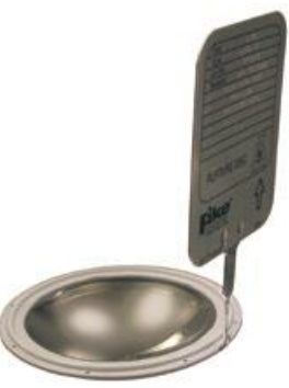
Axius SC Rupture Disc

The Fike Axius® SC rupture disc is specifically designed for the stringent sanitary and aseptic requirements of the biotech and pharmaceutical industries and the hygienic needs of the food and beverage industries. The high-cycling capability reverse-acting rupture disc is free of indentations, crevices or other design features that may trap process contaminants. Fike sanitary rupture discs are in compliance with 3-A standard 60-01. As a result, certified rupture discs are designated as "One-Time Installation," designed to be cleaned through CIP (Clean-In-Place) or Steam-In-Place (SIP) methods without removal and reinstallation, necessary to maintain 3-A compliance.