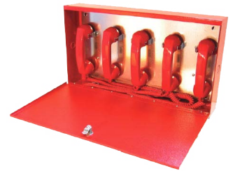
5 Phone Cabinet