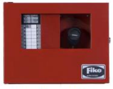
Local Operating Console

Door Dimensions: 41.20" (104.65 cm) high x 24.50" (62.23 cm) wide x 1.73" (4.39 cm) deep Backbox Dimensions: 40.20" (102.11 cm) high x 23.60" (59.59 cm) wide x 3.95" (10.04 cm) deep