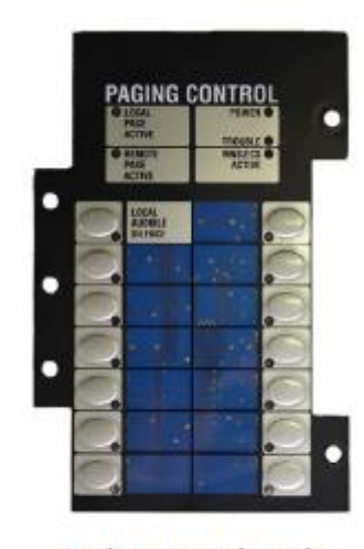
Paging Control Card

The AAP3 may also be manually activated using the LOC paging control card switches. Each of the thirteen custom switches can be individually configured to execute any of the following fire and/or mass notification functions when pressed (i.e., voice Alert, voice EVAC, voice page, voice record page, voice page to Alert, voice page to EVAC, Voice play message ID, MNS reset, MNS silence, MNS page, MNS record page, and MNS play message ID). An LED is associated with each switch to provide positive indication of the status of the switch and the executed function.