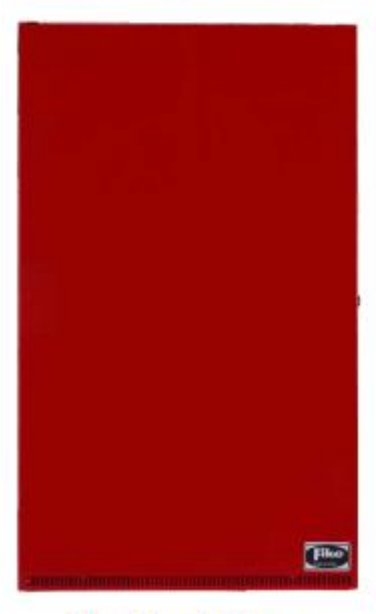
Three Amp Enclosure