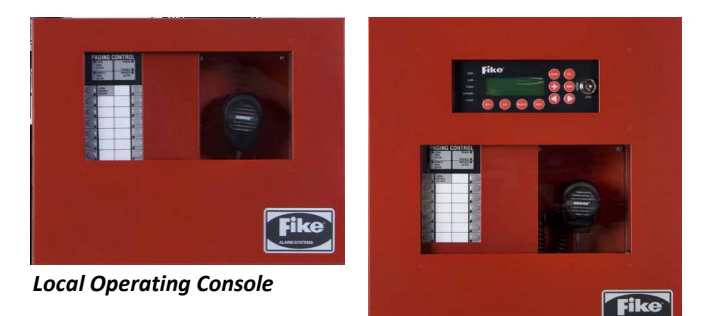
Local Operating Console with RDU