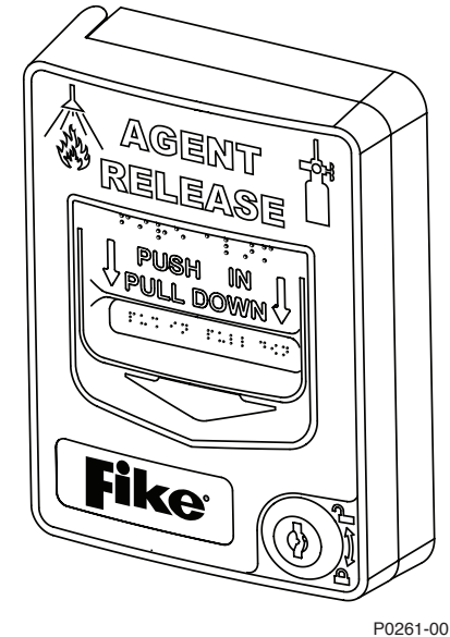
20-1343 Addressable Pull Station