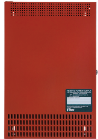
Remote Power Supply