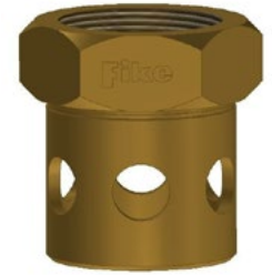
ECARO-25, 360° nozzle