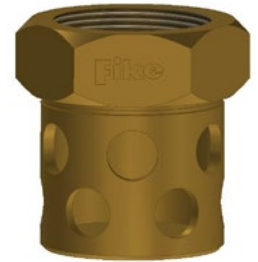
ECARO-25, 180° nozzle