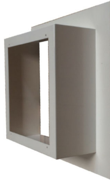
ZC Surface Mounting Frame