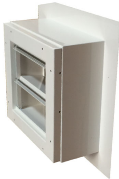
Pressure Vent Mounted to ZC Frame