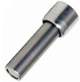
SLIM LINE DETONATOR

The Slim Line Detonator is available in a single configuration. It has a stainless steel body that resists corrosion and has a 5 year shelf life. The Slim Line Detonator initiates detonation of HMX and HNS boosters in a 1.00 IN gap and is intended for use in existing tools that meet the firing pin dimensions and other specifications listed in the data sheet.