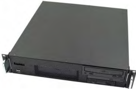
12 and 18 TB NVR